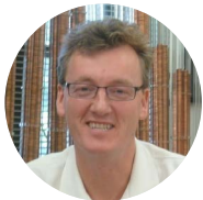
David W. C. MacMillan